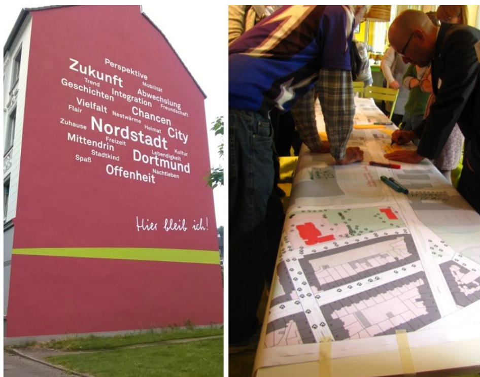
Image 1. The Projekt nordwärts: The plan proposed by the city incorporates an informal approach towards urban space, engaging citizens' participation in various activities

The Living Room Project is inspired by informal procedures of planning. Its purpose is to provide citizens and newcomers with the necessary resources by helping them adjust and connect. Its concept lies on the rehabilitation of vacant buildings existing in the contested area of Nordstadt, by creating an ‘indoor public space’ of cultural interchange. The Living Room Project, advocates the creative and spontaneous use of space, supported by informal processes of planning through the assistance of formal structures. Working alongside the Municipality and different Organizations the need to approach urban planning as a both Top Down and Bottom Up process, has become essential to this project. Thus, further evaluation was required regarding the ways formal, semi-formal and informal actors are bounded together through the processes of planning and implementing.