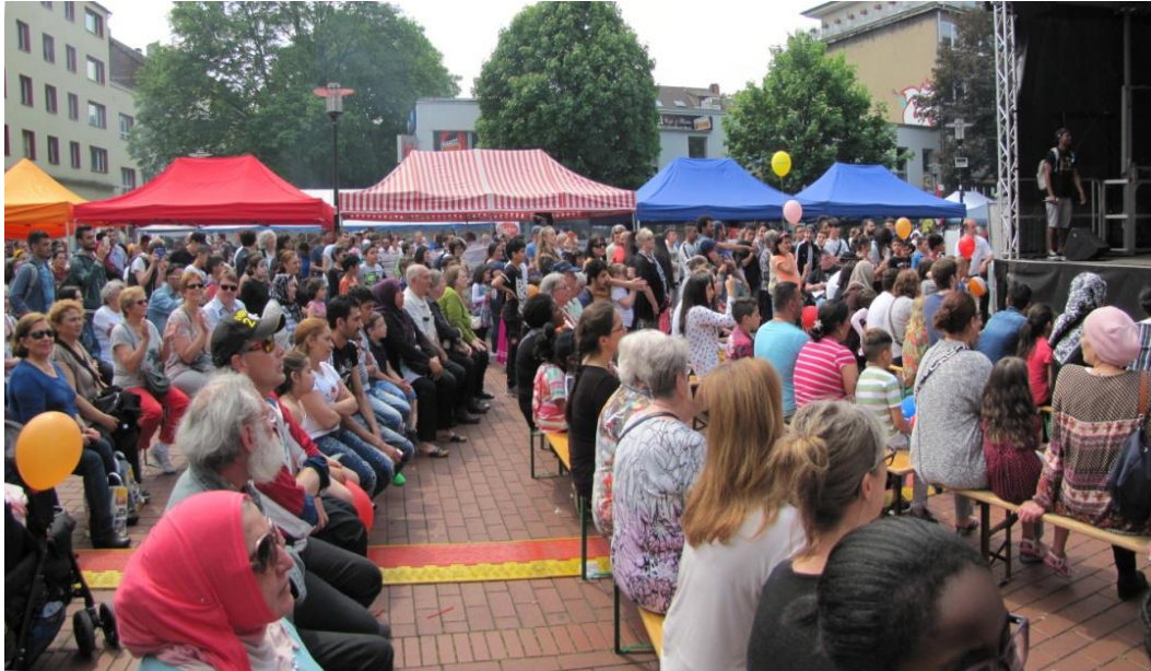
Image 2. International Week (28.05 – 05.06.2016) is an important public event that brings together the different minority groups residing in the Nordstadt area.

City of Dortmund. Emphasizing its informal character, through activities that embrace innovative thinking and the creative use of public space, the festival brings together citizens from all over the city, addressing the need to share and connect. The event takes place alongside NGOs, different associations and local initiatives, who put on display their ongoing projects concerning the City, supporting a variety of concepts related with social welfare issues, cultural issues and integration matters, and so on.