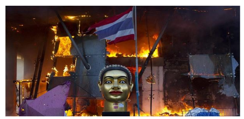
Image 1: CentralWorld Plaza in flames, May 19, 2010.

In late May 2010, billowing charcoal smoke rose from the Ratchaprasong district in central Bangkok, casting a dark pall over the sprawling city. Much of it came from the flaming inferno of the CentralWorld Plaza, Thailand's biggest, and Southeast Asia's second largest, shopping mall. What will likely become one of the most iconic images of the conflagration is a photo by Adrees Latif of Reuters featuring a huge golden head with the likeness of a female deity in a square in front of the mall, her eyes seemingly wide with surprise as a tattered Thai flag fluttered pitifully overhead and the 500.000 metre square complex blazed in the background (see Image 1).